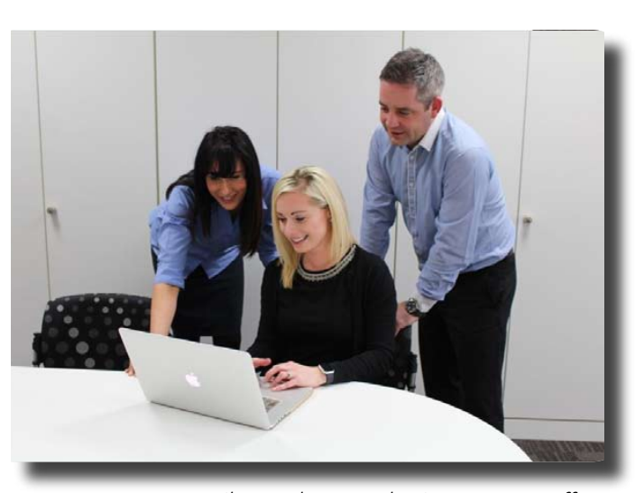
Council owned E-space business centres offers support to local businesses