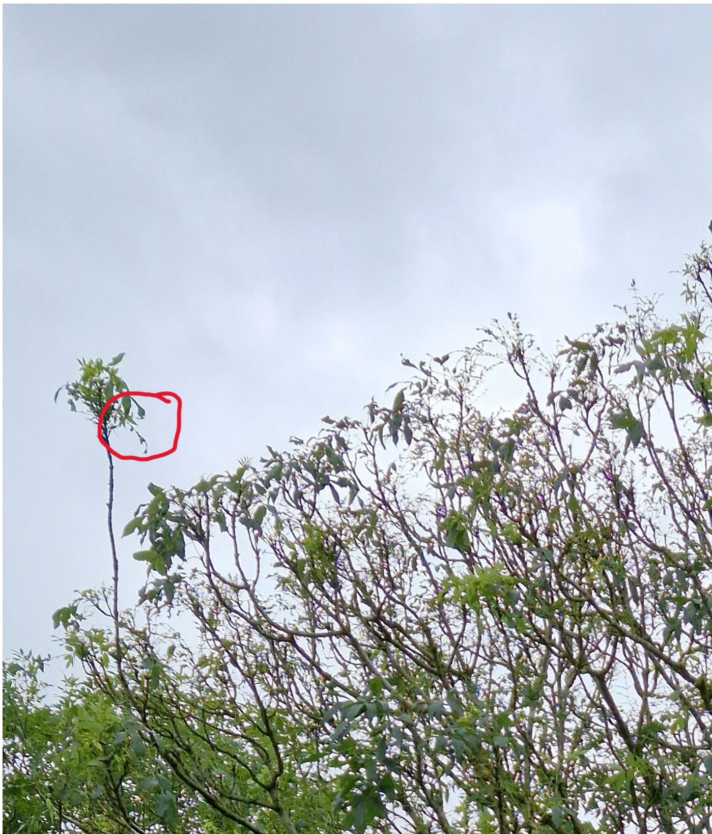
Agenda Item 5