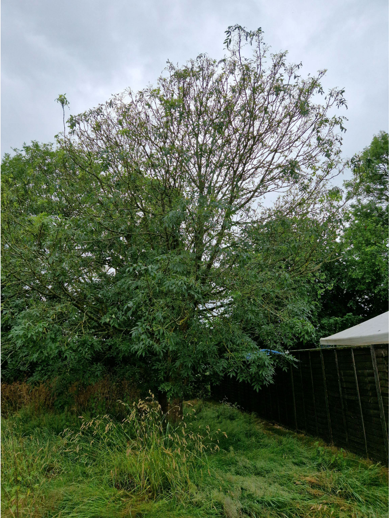
Agenda Item 5