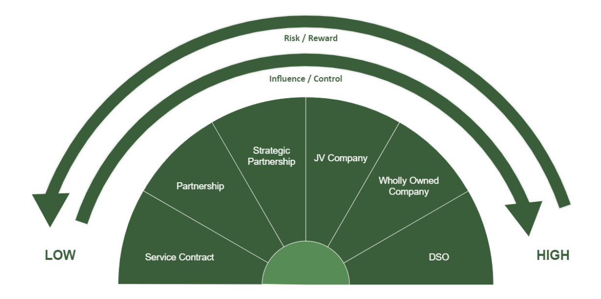
Figure 1: Alternative service delivery model options for delivering services.

There are a range of service delivery options that can be used to deliver services, and these are illustrated in Figure 1. Ultimately the approach taken is heavily influenced by the level of risk and reward a Council wishes to take and receive and the degree of influence and control a Council wishes to maintain over the services.