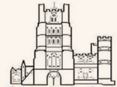
★ ★ ★ ★ ★ ★ Ely Primary Care Networks